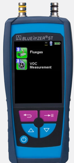
Example on our BLUELYZER ST