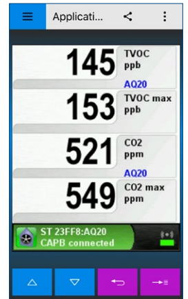
Example for measurement on EuroSoft live app

Range: 450 ppm ... 2,000 ppm CO 2 equivalent, 125 ppb ... 500 ppb TVOC equivalent